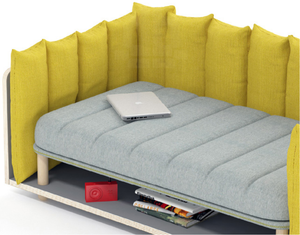
the seat hides spaces for everyday items