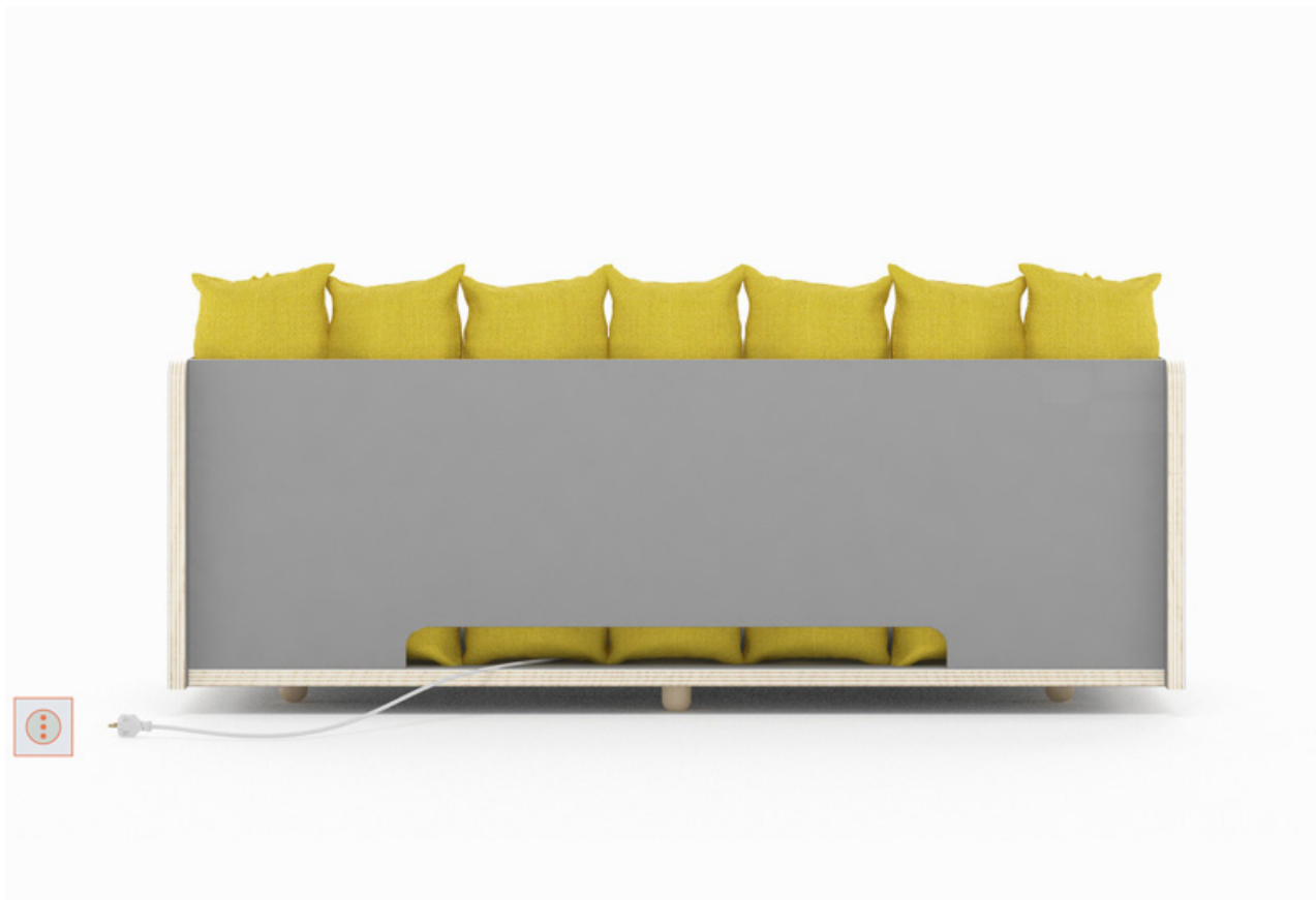
back view with a void in the support for plug and other miscellaneous wires