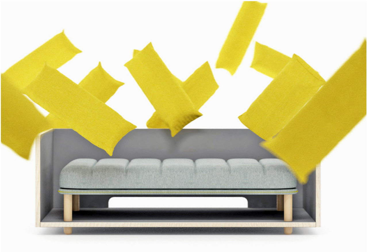
the cushions removed to show the open spaces