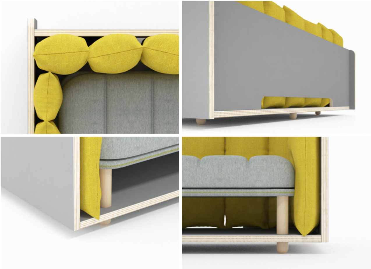
details of the cushions and outer container