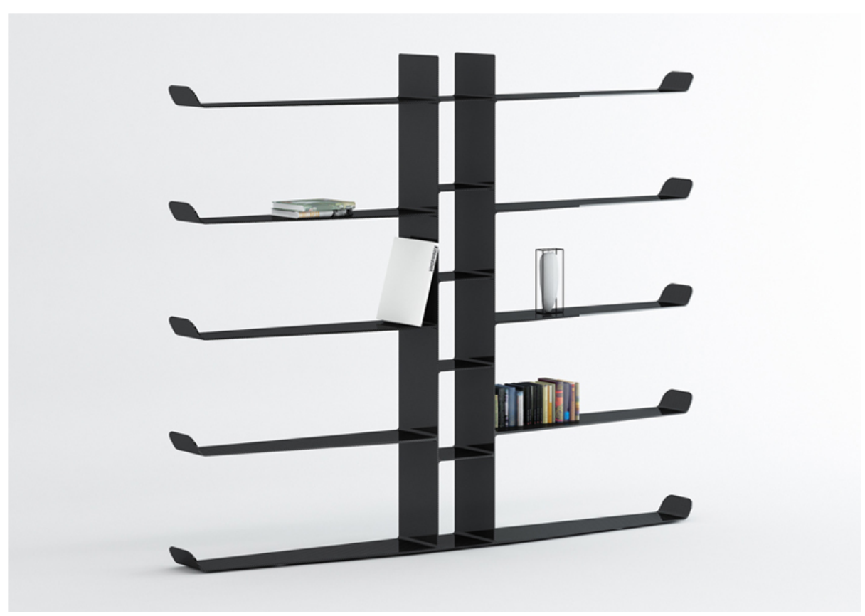
aliante bookshelf 2